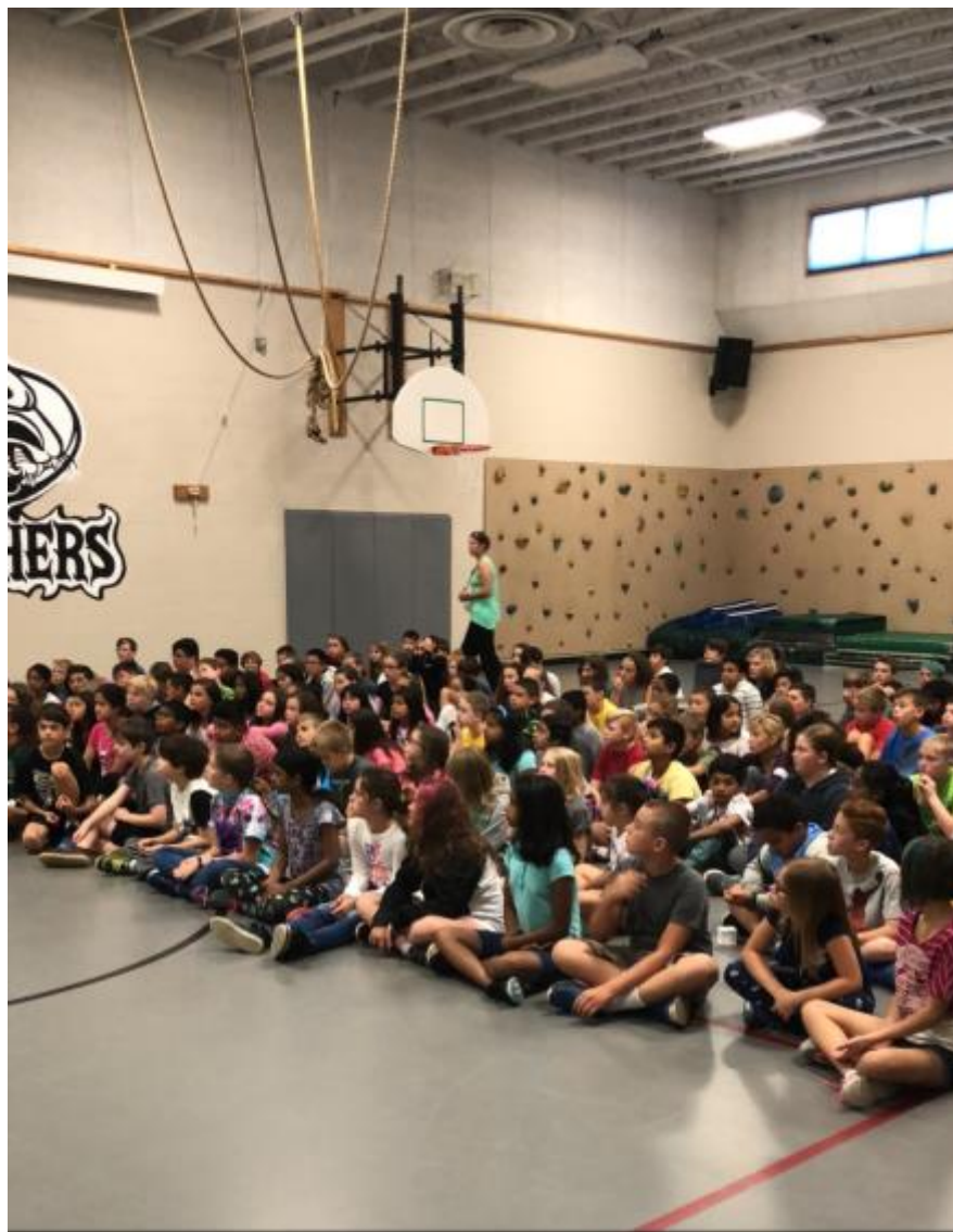
EBOP Assembly for 5th and 6th Grade!