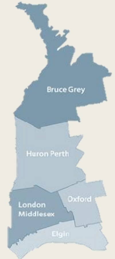
South West LHIN