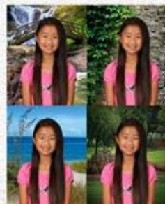
4 - 4x5 Magnet Sheet (w/outdoor backgrounds shown)