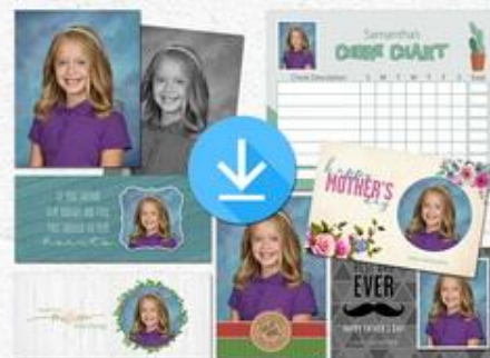
Image Pack Deluxe Digital Download (includes templates, all backgrounds and unlimited copyright release)