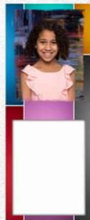
4x10 Locker Magnet