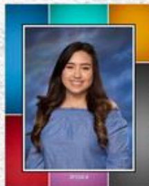
Color Block Border Order Code CB