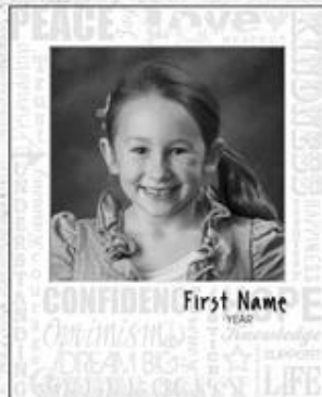
Word Art Print