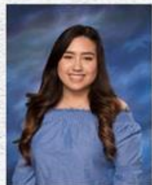
8x10 Traditional No borders or personalization Order Code TT